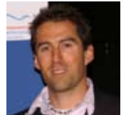
by Eskil Läubli